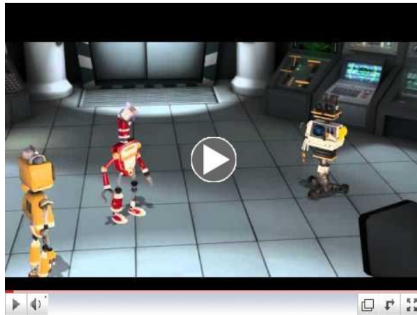
Robot Software, Inc: Internationalization vs. Localization vs. Management